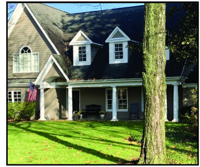
4205 FRANKLIN AVE., KENSINGTON