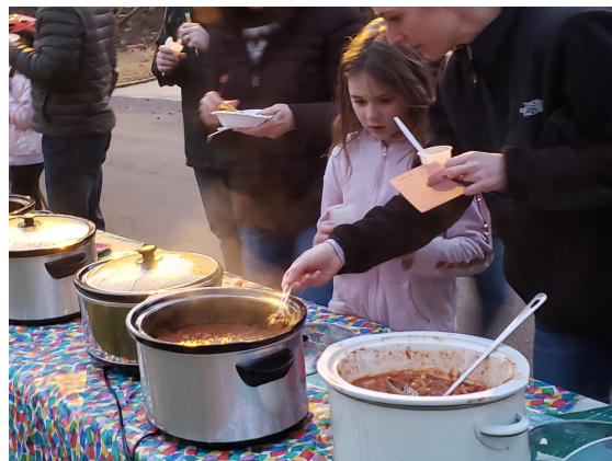
Crock pots in a row