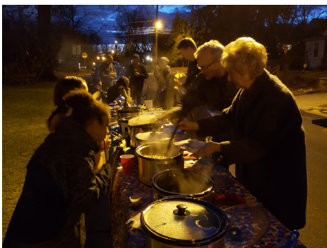
Lining up for the tasting