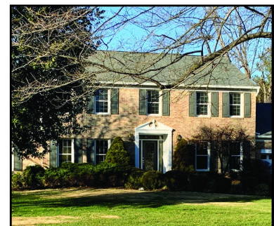
8525 WARDE TERRACE, POTOMAC