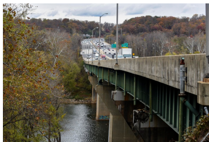
American Legion Bridge

The new plan now calls for starting with