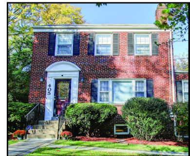
405 MANSFIELD RD., SILVER SPRING