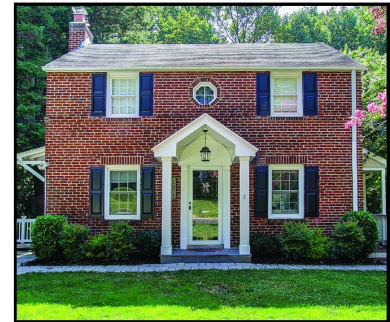
10217 BIG ROCK RD., SILVER SPRING