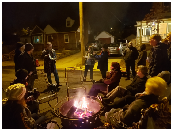
And the winner is.....

And finally, special thanks should go to Montgomery County Government for permitting this street closure and all the others it has allowed in our neighborhood over the years, making this specially-themed block party and many others possible. □