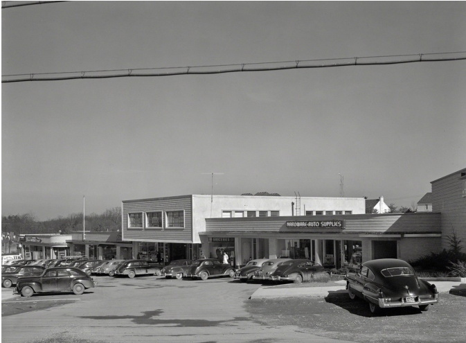
Woodmoor Shopping Center, circa 1950

Even to the most discerning eye, it is almost impossible to tell that the Woodmoor Shopping Center was actually built in seven distinct phases over a period of 30 years. The first group of six stores opened in 1939 at the intersection of Colesville and what was then called Old Bladensburg Road (today's University Boulevard). The final work on the Center was completed around 1970.