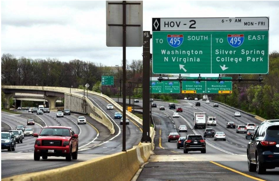
I-270 and the Beltway

After both agencies responsible for stewardship of parkland adjacent to the Capital Beltway (I-495) skewed the Maryland State Highway Administration (SHA) for continuing to push for the construction of up to four toll lanes through sensitive stream valleys without considering any non-toll lane alternatives to ease traffic congestion in the region, SHA reversed course. SHA agreed to review a proposal favored by Montgomery County officials and others to divert I-95 through-traffic across the Intercounty Connector, down I-270 on new reversible lanes (to be constructed within the highway's existing footprint) and across a newly rebuilt American Legion Bridge into Virginia.