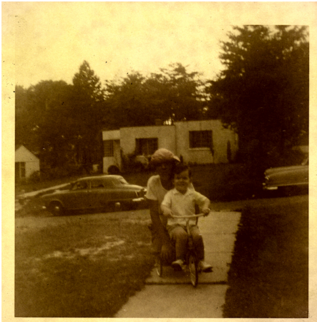
Drake house, c. August 1951.