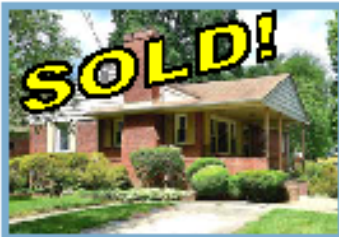
10010 Kinross 13 Offers!