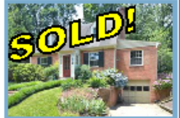
9224 Mintwood Sold for $30k over list

In the last three months, the Tamara Kucik Team has sold 23 homes in the 20901 zip code: