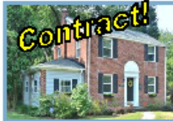
10016 Sidney Multiple Offers!