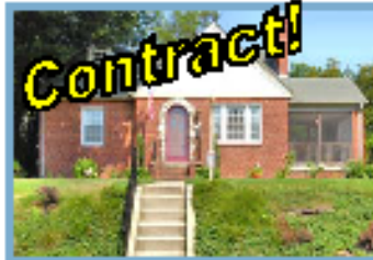
9922 Markham $489,900