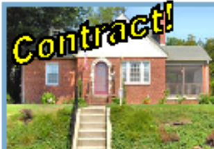
9922 Markham $489,900