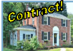
10016 Sidney Multiple Offers!