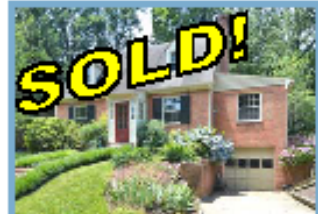
9224 Mintwood Sold for $30k over list

In the last three months, the Tamara Kucik Team has sold 23 homes in the 20901 zip code: