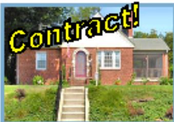
9922 Markham $489,900