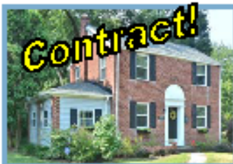
10016 Sidney Multiple Offers!