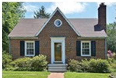
9907 Markham St. • $399,990 Super cute 4BR/3BA Cape with roomy bedrooms & many upgrades.

Our South Four Corners listings sell in 1/3 the time and for sales prices that average 3% more than the competition. We sell more, because we do more.