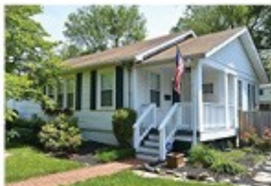
10009 Reddick Rd. • $399,900 3BR/2BA farm house with master suite, updated baths & upscale KIT.