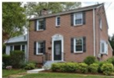
10011 Raynor Rd. • $474,900 Expanded 4BR/4BA Colonial with master suite and upscale renovations!

3 Fantastic Listings brought to you by the Tamara Kucik Team.