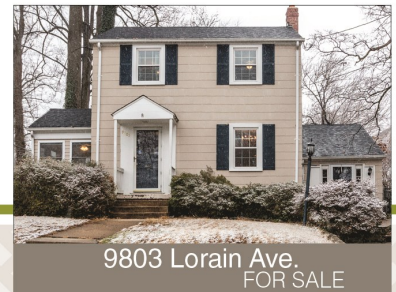
9803 Lorain Ave. FOR SALE