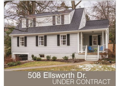
508 Ellsworth Dr. UNDER CONTRACT