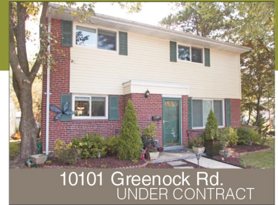
10101 Greenock Rd. UNDER CONTRACT