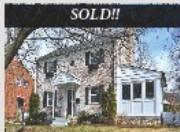
SOLD!! 10017 Portland Rd. • $610,000 Multiple offers and over asking price!