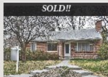
SOLD!! 10112 Renfrew Rd. Sold for $55,000 over asking price!

Selling South Four Corners in 1/2 the time and for 3% more than the competition!