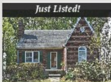
Just Listed! 602 Forest Glen Rd. • $399,000 Fabulous Tudor in the heart of Four Corners.